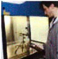
AIR FLOW SPEED TEST

Each Faster cabinet is tested conforming to EN12469:2000, EN 61010:2001 and released with FAT certificate of the tests performed.