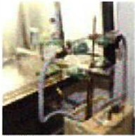
KI DISCUSS TEST