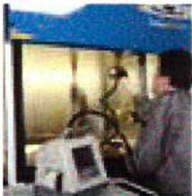
FILTER LEAKAGE TEST