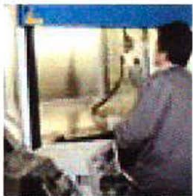
NOISE LEVEL TEST